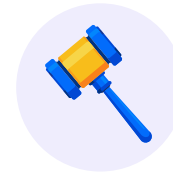
TICKETS & FINES