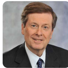
JOHN TORY MAYOR OF TORONTO

This is a step forward in modernizing our government and improving the customer experience for the residents we serve. Residents, businesses and visitors to Toronto want a simple, consistent and connected interaction with the City and this new service offering will help us deliver just that.