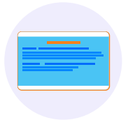
LICENCES & PERMITS